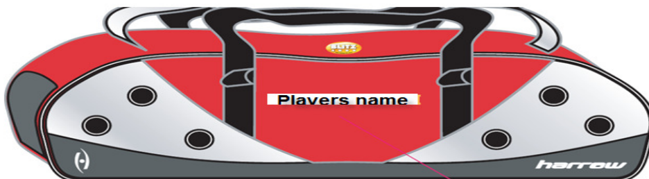
Side Two, Embroidered